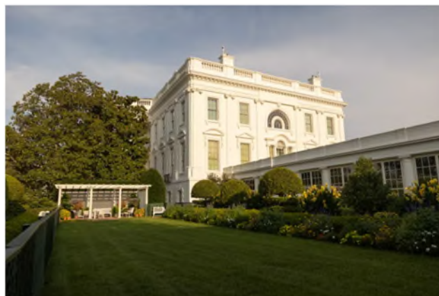
Figure 5 – Jacqueline Kennedy Garden (2023).

30. Located on the grounds outside of the East Wing was a garden, constructed shortly after the East Wing itself. Dating to 1903, but dedicated to former First Lady Jacqueline Kennedy in 1965, the Jacqueline Kennedy Garden balanced the Rose Garden on the west side of the White House. The Jacqueline Kennedy Garden, depicted below, featured a defined central lawn bordered by a brick walk and various botanical specimens. A pergola designed by the architect I.M. Pei was located at its west end. Like the Rose Garden, the Jacqueline Kennedy Garden was used to host events and receptions. Along with the East Wing, the Kennedy Garden was demolished in its entirety by the Defendants.