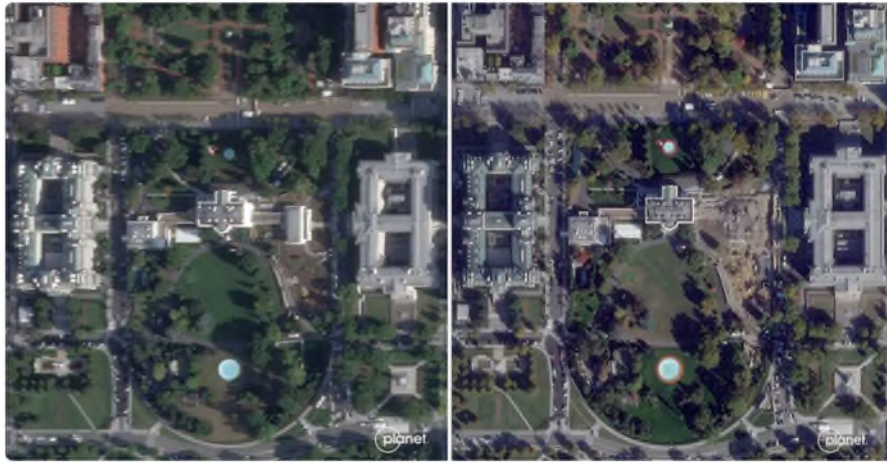
Figure 12 (left) – Satellite photograph of the White House and grounds taken on September 26, 2025.

61. A satellite photograph likewise depicted cleared space where the East Wing previously stood.