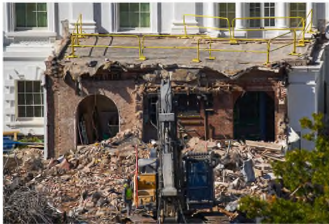
Figure 14 – Photograph of debris at the East Wing taken on October 23, 2025.

62. And photographs taken from near the White House showed the demolition of nearly the entire East Wing and east colonnade.