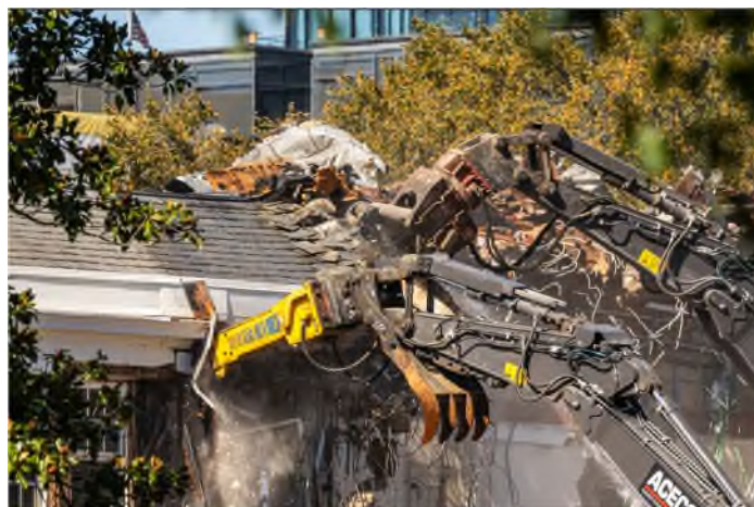
Figure 9 – Demolition of the East Wing of the White House.

49. On October 21, 2025, various media outlets reported on the demolition of the East Wing. Images published by the New York Times showed heavy machinery tearing down the East Wing’s façade.